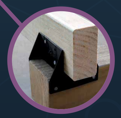
Joist Connector The positive connection between joist and bearer