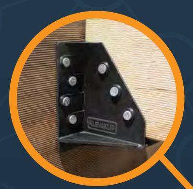
FREP The outdoor joist hanger