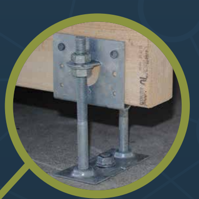
Adjustable Joist Support For decks over concrete slabs

KLEVAKLIP** ENGINEERED BUILDING PRODUCTS